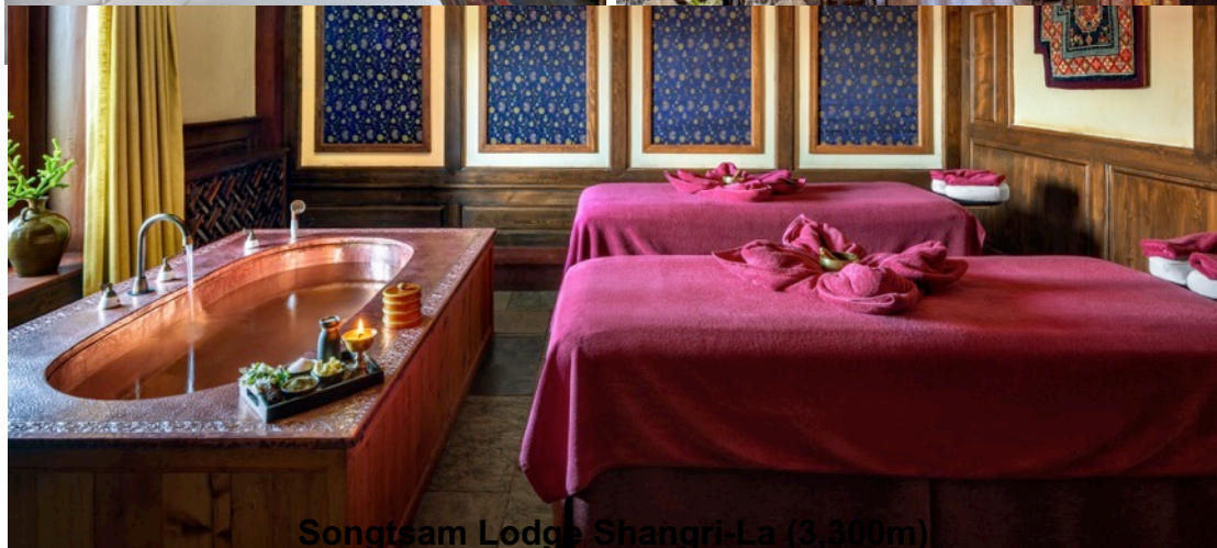
Songtsam Lodge Shangri-La (3,300m)

Songtsam's first lodge opened its doors in 2001 and underwent a renovation in 2019. Tucked away from the hustle and bustle of downtown Shangri-La the lodge is located in Kna Village, only a 2-minute walk to the Songzanlin Monastery. The lodge is a beautiful four-storey stone building housed in a traditional Tibetan dwelling within a self-sufficient farming village, where founder Pema Dorjee spent his childhood. Rooms excel in creating a true feeling of home, all of which are decorated in a Tibetan style