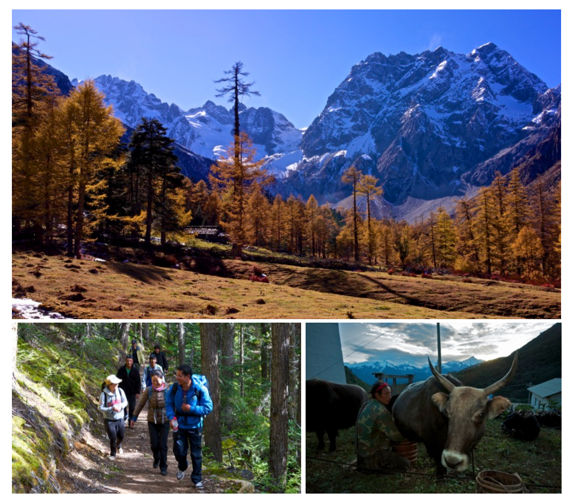
Understand the Rich Culture Through Experiential Activities

Every year Tibetans and travellers from all over the world make their journey to worship Kawagebo, the highest peak of the Meili snow mountain range. Our tranquil lodge is located away from main tourist area and we know the most beautiful and untamed paths around Meili. Our guided hikes take you off the beaten track allowing you to connect with nature whilst at the same time offering a private experience of this spiritual land with no crowds.