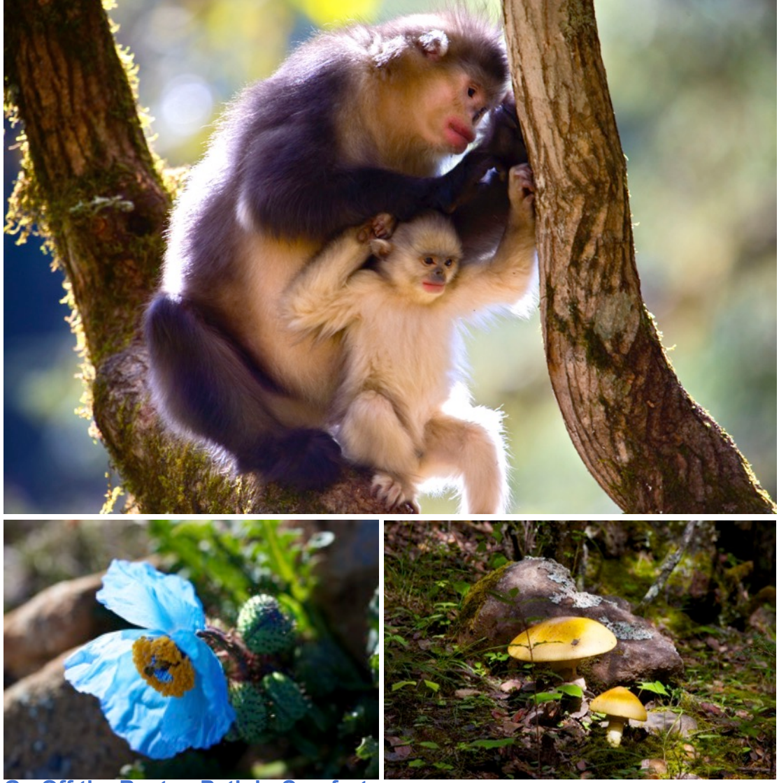
Go Off the Beaten Path in Comfort

Throughout the journey guests will be staying in Tibetan style boutique hotels and lodges. All Songtsam properties feature an exquisite level of amenities, handpicked antique furniture and art collections, and a level of service that one wouldn't expect for such remote places.