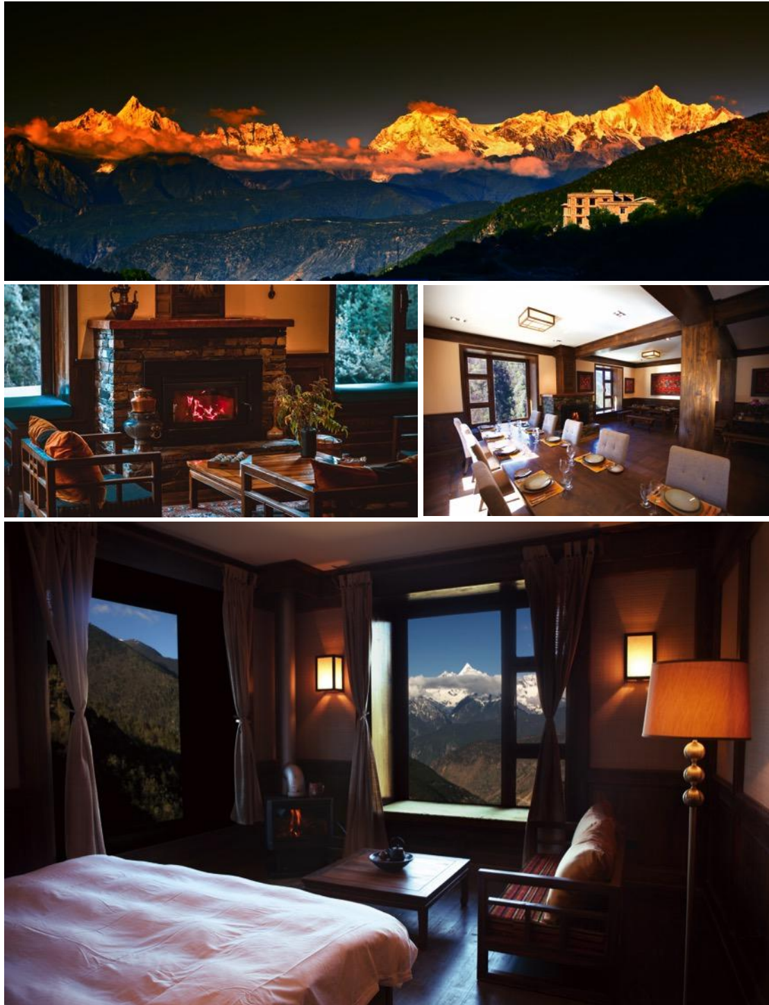
Songtsam Lodge Benzilan (1,900m)

Built in an unspoilt village away from any tourists and overlooking the majestic Meili mountain range. Rooms are furnished with large comfortable beds, sofas, and timber flooring, providing a warm atmosphere that combines rustic charm with modern comforts. Most of the rooms come with a cosy fireplace and a stunning view of Meili Snow Mountain.